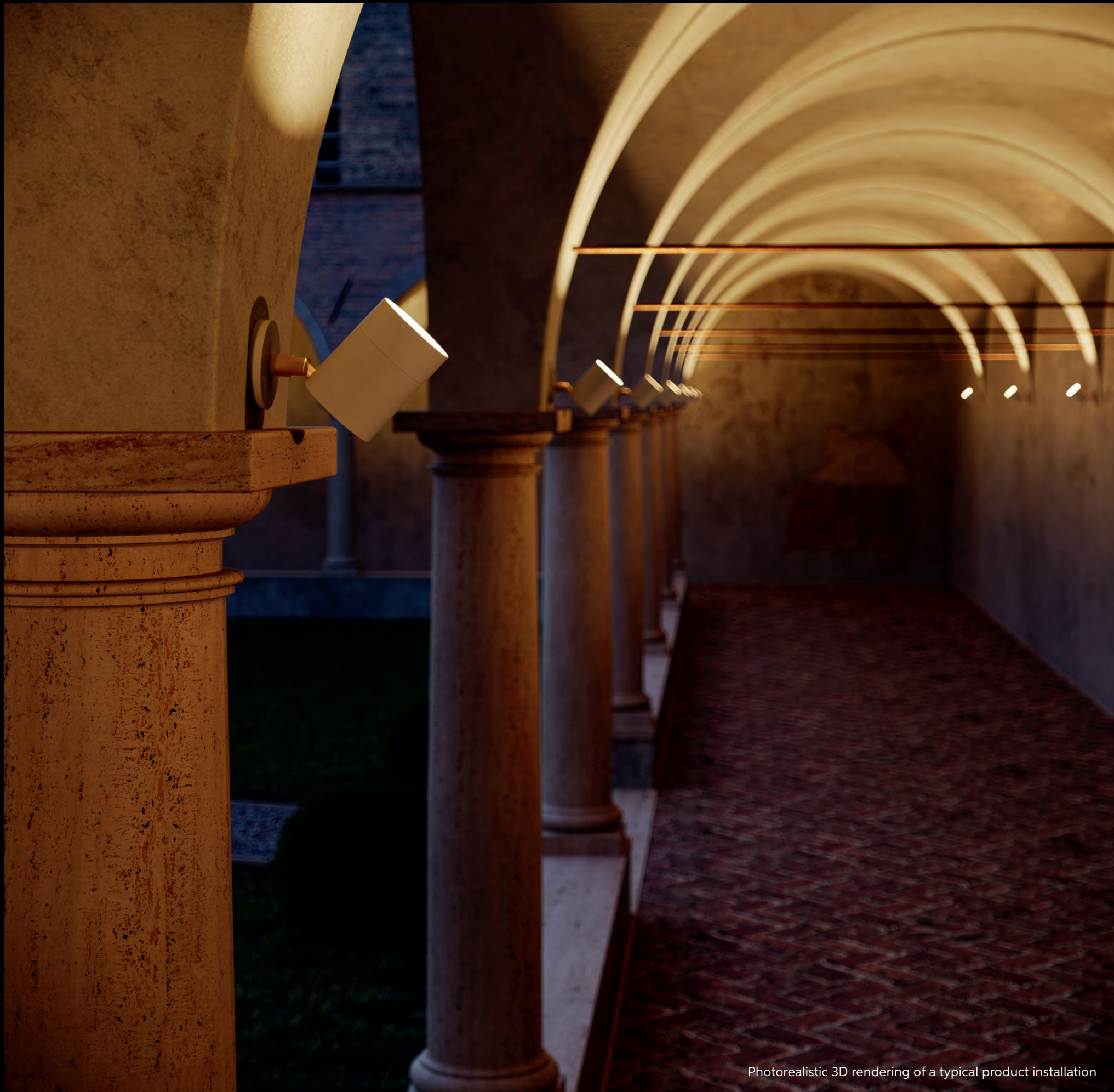
Photorealistic 3D rendering of a typical product installation